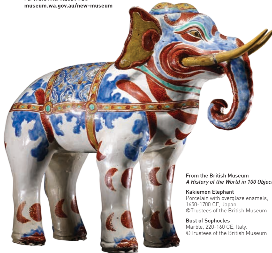
From the British Museum A History of the World in 100 Objects

For more information visit museum.wa.gov.au/new-museum